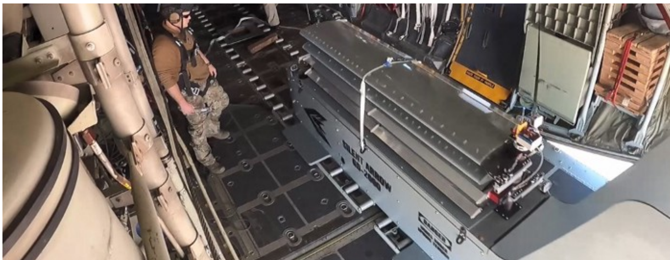
C-130 'Loadies' get ready to "kick [the Silent Arrow] out the door".

He also provided the brief comment: "C-130 Silent Arrow deployments carrying a record-setting 1,000 pounds of emergency cargo, rigged as a CDS [container delivery system] bundle, loadies kick it out the door, wings spring open and Silent Arrow turns away on course for these completely autonomous flights. Proud of this team!"